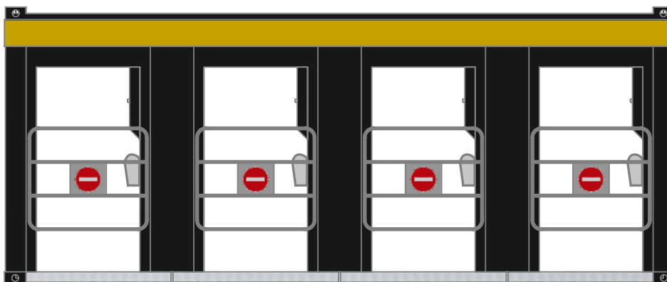
GATE STATION - BACK VIEW