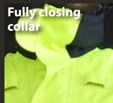
Fully closing collar