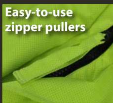
Easy-to-use zipper pullers